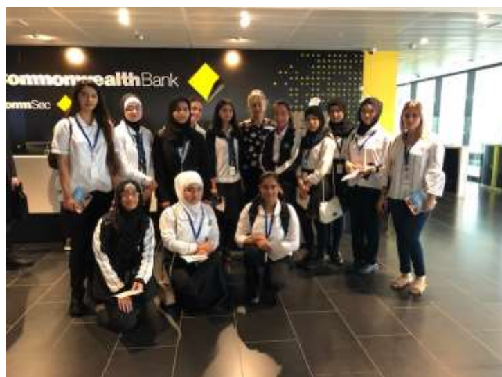
Girls in Tech visit to the Commonwealth Bank