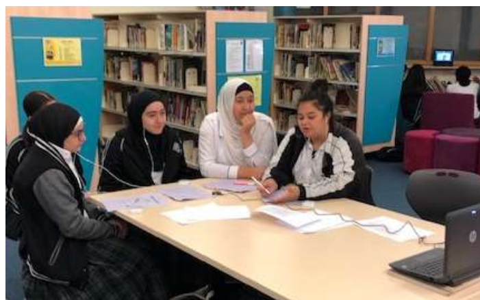
Above and below, Year 10 students engaged in My Road online mentoring sessions.