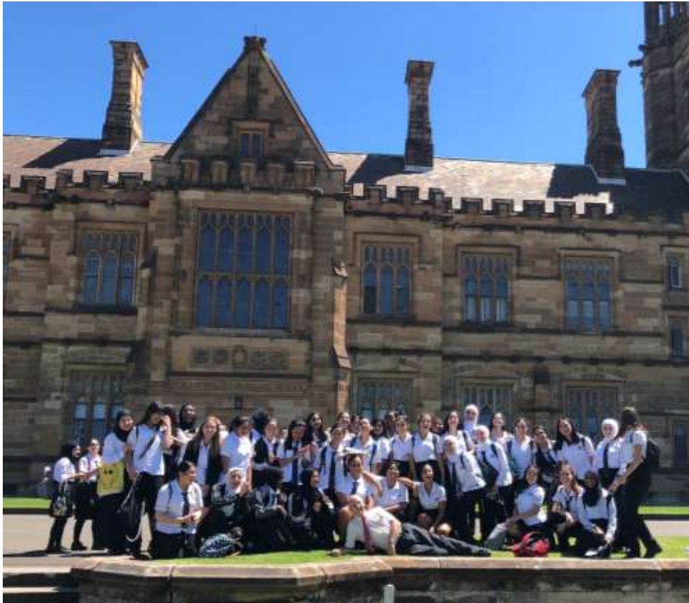
Futures Friday at the University of Sydney for 50 Year 11 girls in February, 2019.

The six elements of wellbeing in 'The Learning Curve' Positive Education Wellbeing Program that all students are engaging with once a week in our PBL lesson on Wednesdays are set out below.