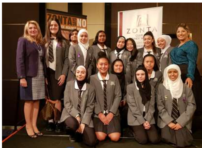
Our students at the ZONTA Breakfast

Maximum school attendance and minimal days late to