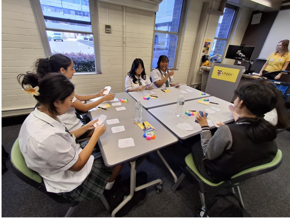
1 - Students thinking about their core values and interests