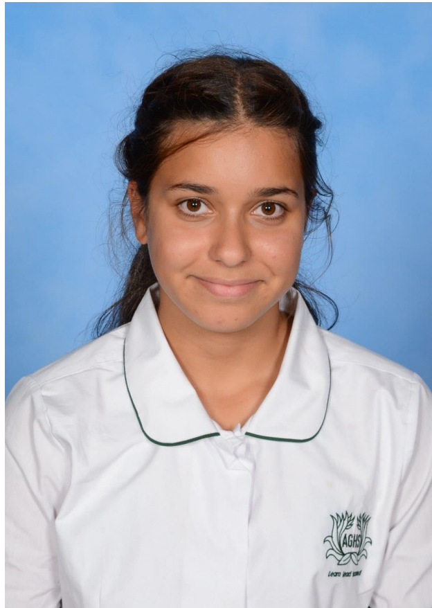
7 - Year 9