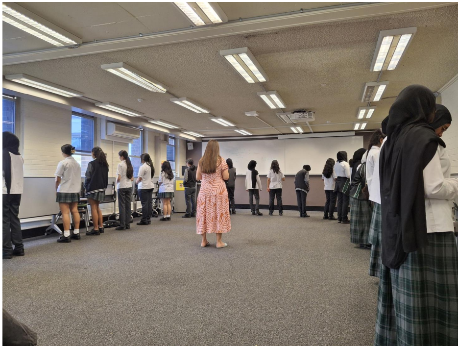
2 - Students focused on breathing techniques and projection in preparation for important presentations